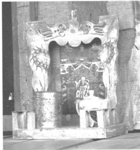
SPIRIT HOUSE ON A POOR FAMILY'S PORCH

Cambodia practices Theravada Buddhism, a form of the religion wherein Monks live an intensely religious life and the responsibility of others are much less formalized. One obligation of non-monks is to offer food to the monks in the morning, which is the only time of day they are allowed to eat. The monks in return offer blessings to the givers.