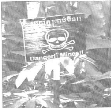
Beware of minefields