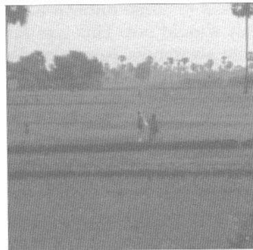
Beware of open fields