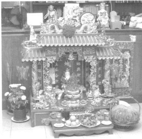
SPIRIT HOUSE AT AN UPGRADE RESTAURANT