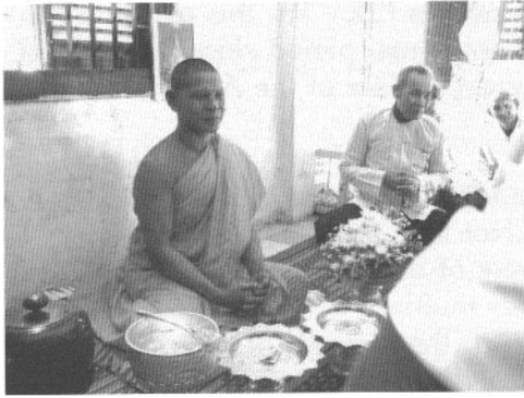
THE HEAD MONK LEADING BLESSING SERVICE.