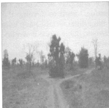
Stay on paths