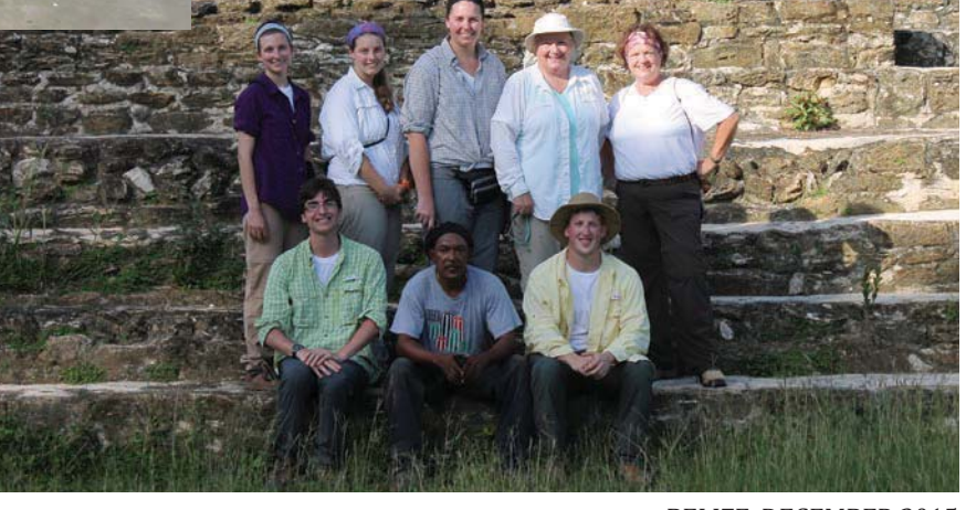
BELIZE, DECEMBER 2015