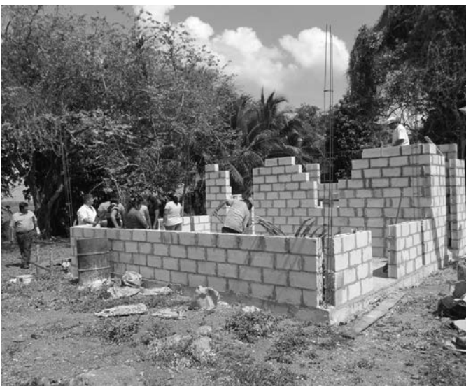
San Carlos Women's Group with Bryant Green, scholar, construction of SunBreeze restaurant

I returned home and began fundraising to support the construction of an actual restaurant in San Carlos. While the Belize learning community and I worked to secure funds to construct and furnish the restaurant, the women's group continued to serve customers in the makeshift building, without refrigeration and simply cooking over a wood fire. I returned to Belize with Mary Ann Studer and one community member in April, 2012 with $4000 that we had raised for the project. The women's group had secured the property for the building, poured a foundation, and ordered all the materials necessary to complete the construction. We purchased the materials for the building itself as well as a freezer and a stove for the Sunbreeze restaurant with the funds raised. This is a wonderful example of an effective partnership, and this project has successfully broken the economic barriers that had restrained the village in the past.