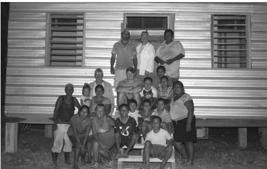
Teachers' House in San Carlos

In late April 2011 I traveled back to Belize with Mary Ann Studer and three community members to construct the house in just five days. In temperatures reaching 100 degrees each day, we secured the materials and with the help of the community, completed the house late in the evening just before we flew home. It has been reported that the teachers utilize the house on a regular basis and as a result the students have access to both light and academic support in the evenings.