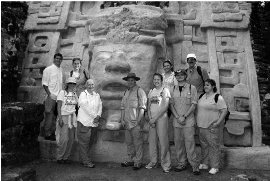
Belize team 2010-2011 at Lamanai Maya ruins

Although English is the primary language within the Belizean school system, many families still speak Spanish at home. As a result, it becomes the schools’ partial responsibility to make sure the students speak English as the primary language. By assisting the teachers of San Carlos and St. Paul’s Bank with new lesson plans that include the families at home, we began the process of implementing English at home within Belizean communities.