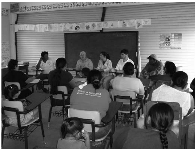
Village meeting to discuss water contamination